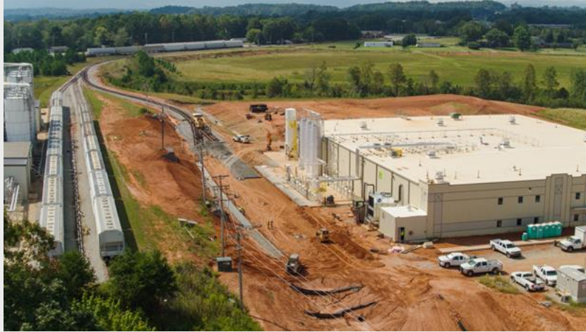
Borealis Compounds in Taylorsville, NC

fun&games: How many turnouts are in this photo? Answer below.