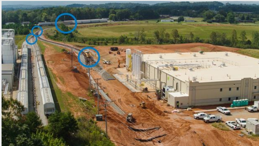
Borealis Compounds in Taylorsville, NC